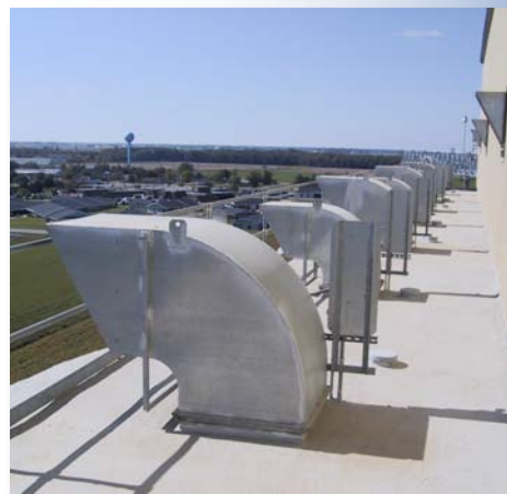
690 FLAT ROOF SERIES