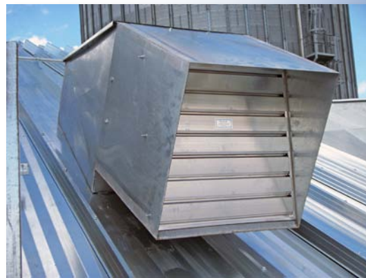
692 NOTCHED SERIES Fits over the roof rib.